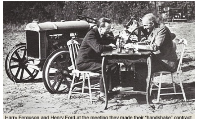
Harry Ferguson and Henry Ford at the meeting they made their "handshake" contract.