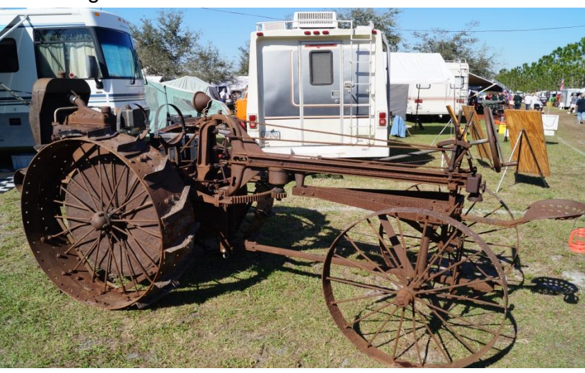
1 of 800 built Minneapolis universal tractor built

Once again we had a wonderful winter down south but