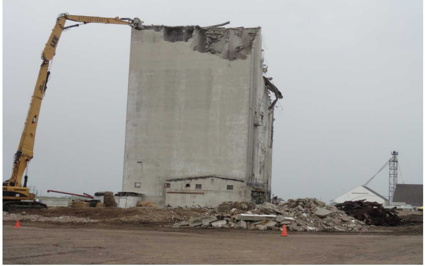
For those of you who seldom get to the eastern end of the county the town site of Gluek is being dismantled in a rapid fashion. Cargill has decided to abandon their elevator but leave the office and fertilizer operation for the time being. The large steel grain tanks were dismantled and shredded on site. The concrete structure shown is being literally eaten up by a packman device attached to the large crane. I suspect that by the time the newsletter gets to you it will be all over.

The next membership meeting will be June 21, 2016, The annual Heritage Hill Family Picnic will be at 6:00 p.m. followed by the business meeting. Please see the picnic insert for information. Ructer shown in the pictru