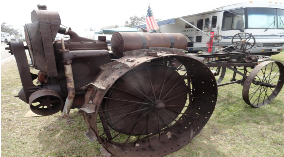
Rare 1906 Minneapolis

**Membership Meeting for March is 3/21/2016 at 7:00 pm at Montevideo Community Center**