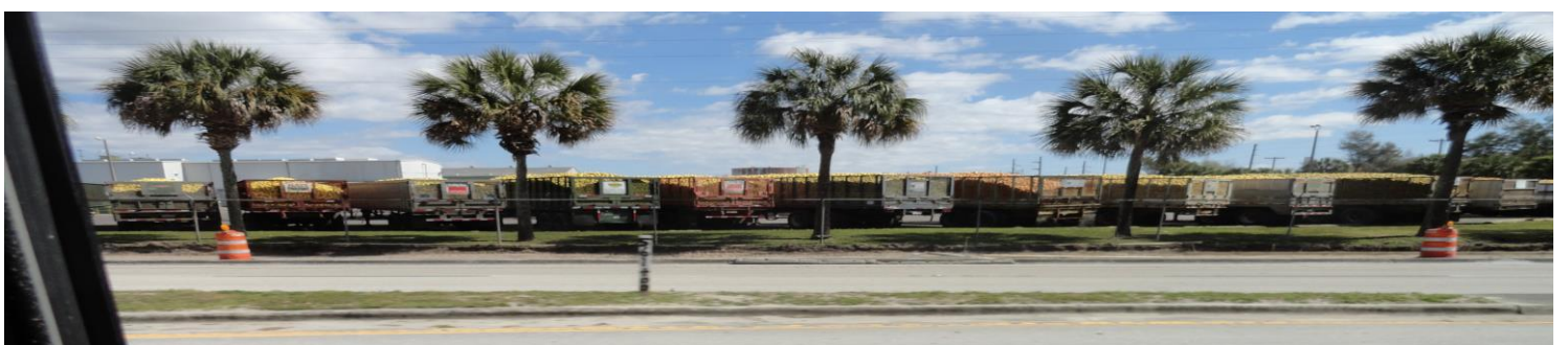
Semi-trailers of oranges waiting to be unloaded