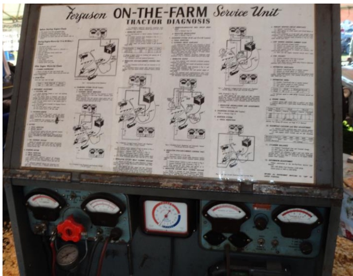
Ferguson "ON THE FARM" service unit

This year with our feature being "Massy" we came across a display that took one man four years to complete. It wasn't exactly a Massy but it was in the Massy tent. It was a 2N Ford completely cut in half, in every detail. The engine, the transmission and rear end: even the battery and the radiator. Also quite rare is a Ferguson "One The Farm" service unit. I have never seen one of these before.