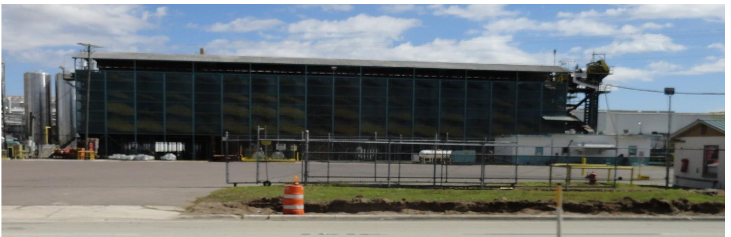
Huge holding bins full of oranges to be juiced

As noted in the president's address we are in central Florida now and experiencing warm, pleasant weather. There is a lot of activity here as it is orange harvest. Trucks loaded with oranges are as numerous as sugar beet trucks during fall harvest. There are hundreds of acres of orange and tangerine trees in the area. I was so sure that there was a mechanical orange picker, Wrong again. The oranges are picked by hand by workers with ladders and large bags and loaded in semi-trailers similar to our sugar beet trailers. I can't imagine how many sacks of oranges there are in a semi-truck but one went past our campsite every 20 minutes. In central Florida the oranges are squeezed for juice. I asked about the by product and was told what little there is is fed to cows and there are a lot of cattle in this area. Same with tangerines except instead of picking, they are clipped from tree with clippers because pulling on a tangerine will remove the core and then they are not saleable. All labor is manual and workers are driven out to the fruit groves each day in white school buses.