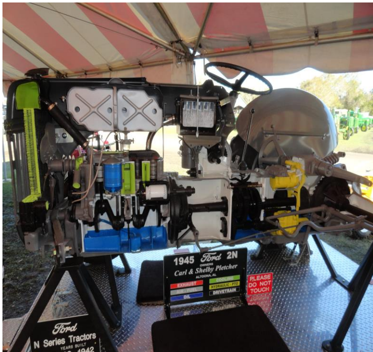
½ of an Ford 2N

T Touring car and a model T. The one thing Florida has going for it is they have a lot of "Old People" that have moved south with little to do. No local connections or farm places to consume their time so they work year around at the show site. As with our local shows one sees changes taking place and wonders what five or ten years will bring. This year I noticed the absence of steam engines in both shows. Also there are few young kids attending the show even though this year they tried to create a circus atmosphere in one area.