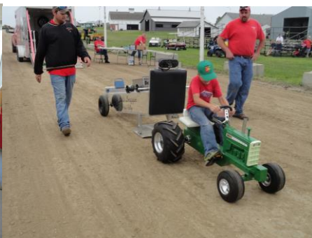
Little scrapper tractor pull