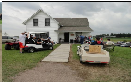
Pickin on the porch