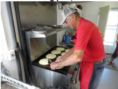
Our official veteran pancake maker